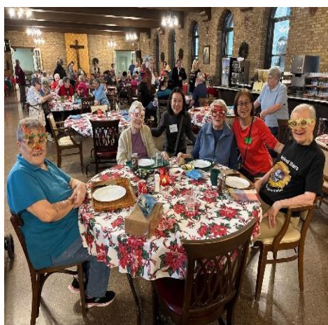
Xmas party in the main dining room