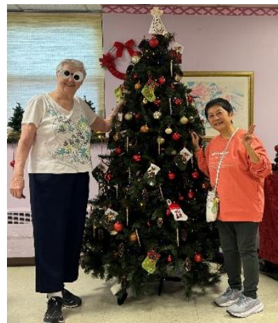
Eden - Riverview dining room