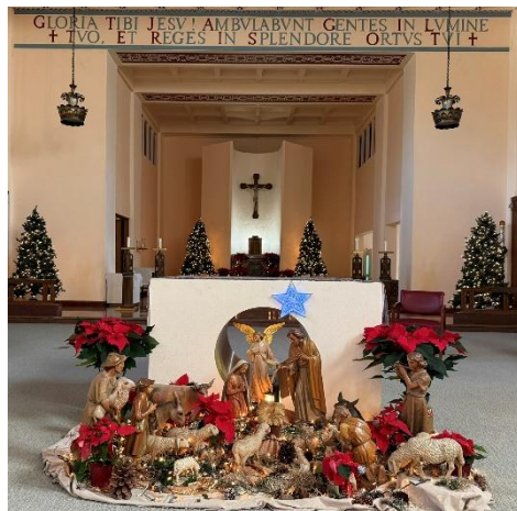
Main Chapel during Xmas