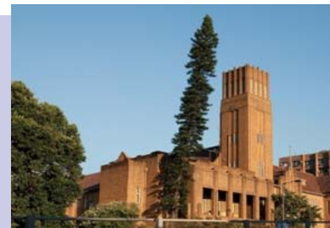
Over 70 years old MCS "ghost" pine tree was removed on Feb.6, 2010 at 9 a.m. (HK time)