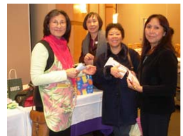
AGM at Fisherman's Terrace, Richmond November 7, 2009