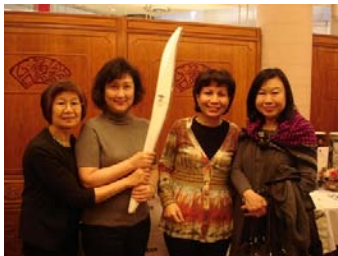
Spring Dinner on March 28, 2010 at Fisherman's Terrace Restaurant, Richmond